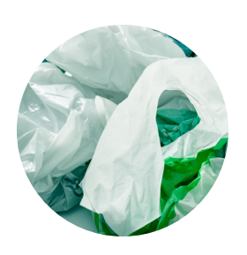
plastics Implement a comprehensive plan to address our massive stream of single-use plastic waste