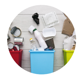
Collect all recyclables All local recycling programs should collect all the commonly recyclable materials in our waste stream