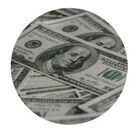
recycling Increase funding for our recycling programs—and make the producers pay for the waste they make