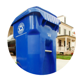
Implement recycling Local recycling programs for all Pennsylvania cities and towns

We can make Pennsylvania the national recycling leader it was 35 years ago when our elected officials passed Act 101 by updating our state's law and using many of the best recycling practices being successfully used around the country today.